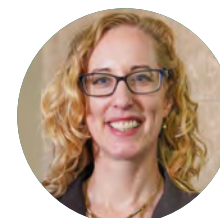
Lorna Slater Minister for Green Skills Circular Economy and Biodiversity